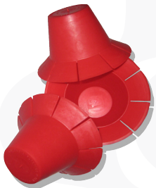
Red Pilgrim Cap (part # PR-40-02) 270 per box

MTi GROUP offer an extensive range in blocking products for the mining industry. All blocking products have been selected for ease of use and to create a varied and extensive range of options to suit your particular situation. With consideration of the broad conditions and circumstances you encounter MTi Group have designed diverse top quality blocking products at competitive prices.