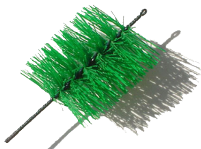
Slump-Stoppa Bottle Brush (part # SS series) 48 per box

MTi spiders are designed to suit both Orica and Dyno detonators. For holes from 64 - 102mm we can supply suitable spiders to ensure easy tracking and assured retention. MTi Group can also offer a detonator spider to suit particularly bad ground where deep holes and fractures can offer problematic installation. Made from chemically resistant Polypropylene MTi spiders come in a big and small size to provide a suitable low cost alternative to conventional supply.